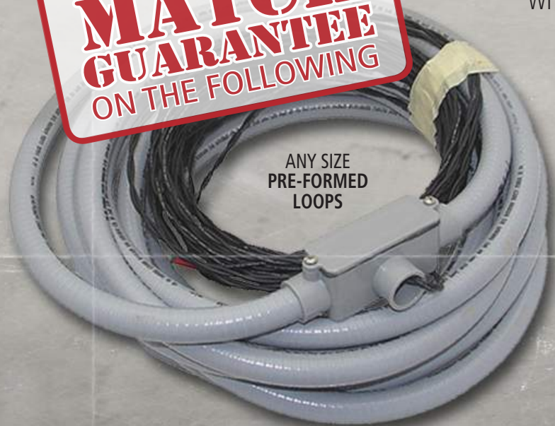
ANY SIZE PRE-FORMED LOOPS