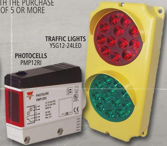
TRAFFIC LIGHTS YSG12-24LED