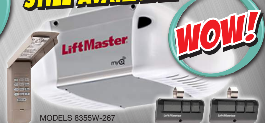
MODELS 8355W-267 & 8365W-267